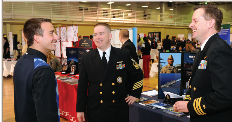
Students explored opportunities at the Career and Graduate School Fair during Engineers Week.