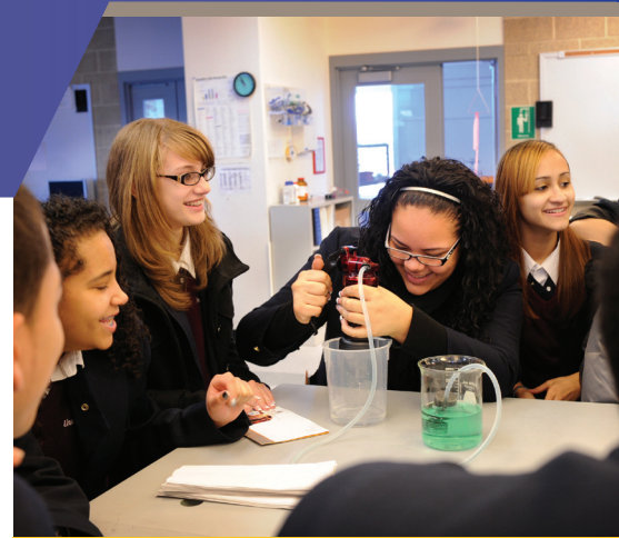
Students from the LEAP Academy University Charter School enjoyed hands-on engineering projects during a recent visit to the College.

CHAMP isn't Rowan's only Camden-based outreach. On Feb. 11, 25 science, technology, engineering and mathematics students from Leadership, Education and Partnership (LEAP) Academy University Charter School visited Rowan's Glassboro campus for a demonstration of the College