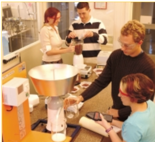
Chemical Engineering students gain experience in the lab.