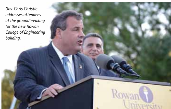
Gov. Chris Christie addresses attendees at the groundbreaking for the new Rowan College of Engineering building.